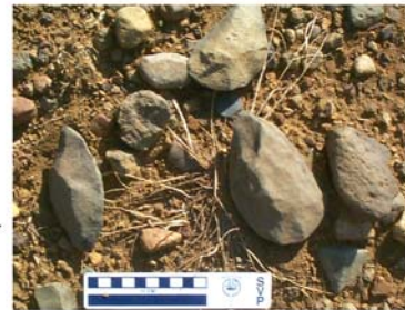
FIGURE 3. Surface artifact scatter along the site's northern slopes.