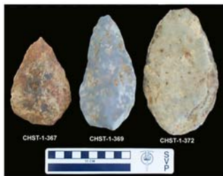
FIGURE 4. Three of the 17 hand axes from 2 x 2 meter test unit EX3 (see Figure 5 for test location).