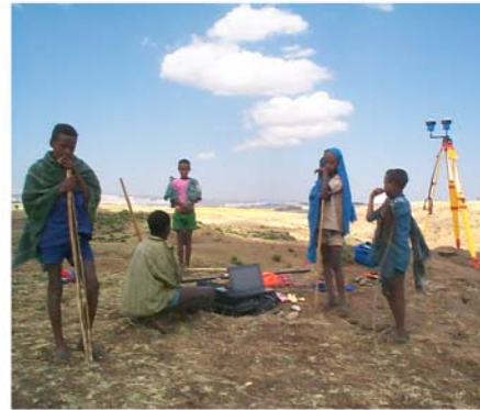
FIGURE 2. Using synchronized GPS receivers and in-field data processing at Chilga Kernet.